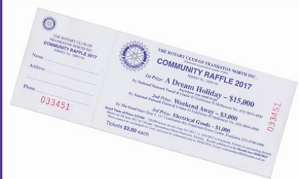
Frankston North Rotary and the Frankston City Council working together for the Frankston Community.